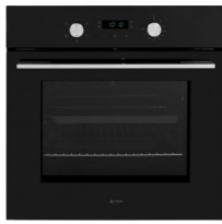
60cm fan oven.