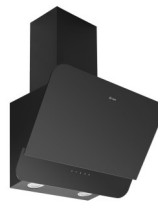
60cm angled extractor.