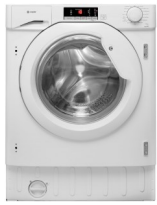
Built in washer.